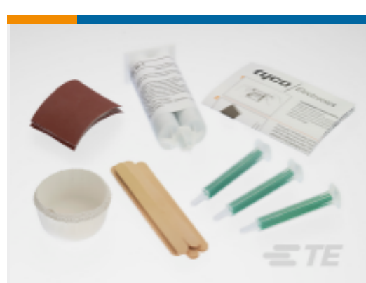
TE Part # 657863-000 S1125-KIT-8